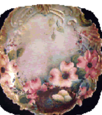
Nice to Meet You (Acrylic)