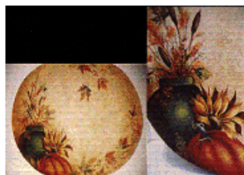
Fall Pumpkin and Real Leaves (Acrylic)

If you have question, please call me. 721-8557.