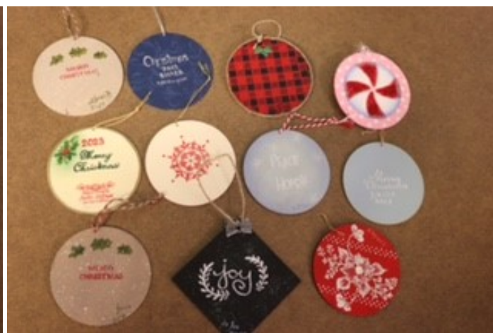
Christmas Ornament/Exchange Fronts & Backs

Show & Share projects that were painted by members and shared.