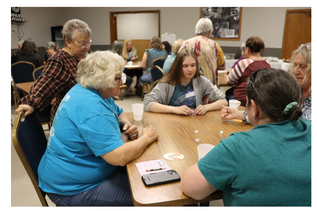
Playing for Fun!