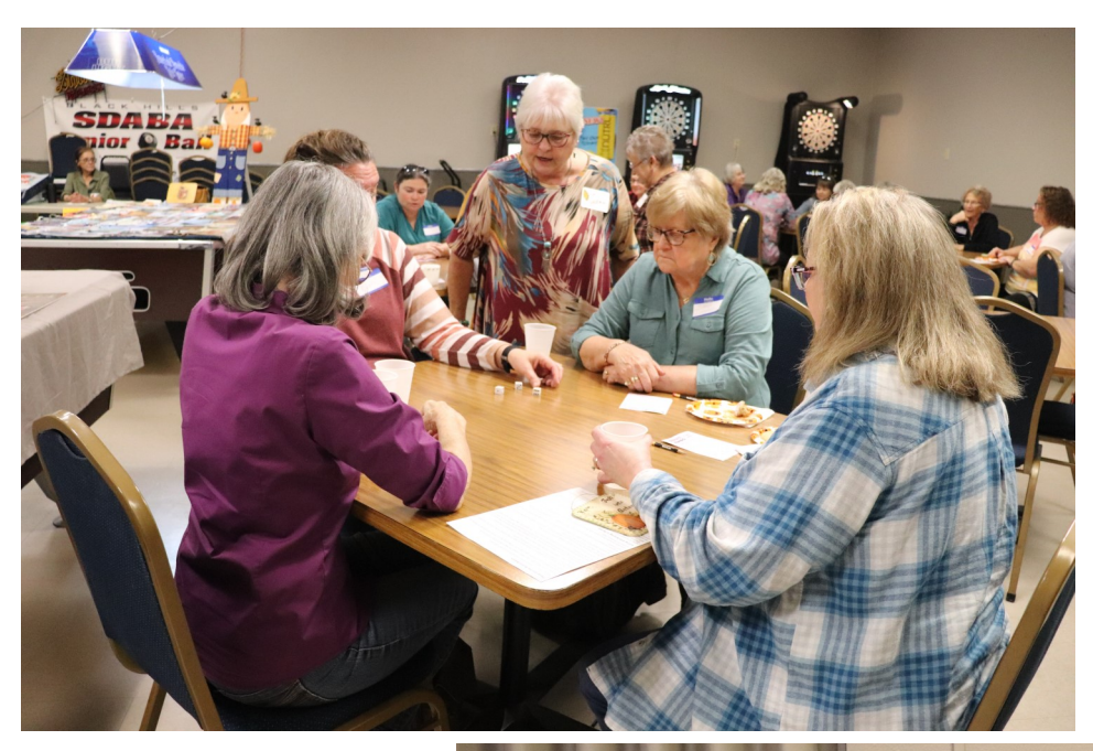
Playing for Keeps!